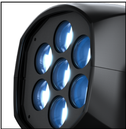
Optical group without soft frost filter