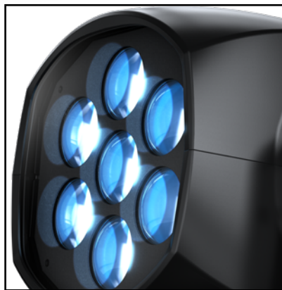
Optical group with soft frost filter inserted